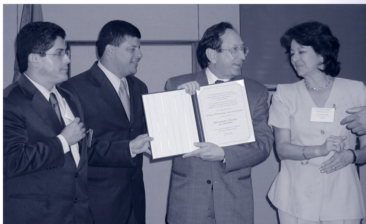
Colombian mayors accept their Democracy Courage Tribute.

■ Iran's Pro-Democracy Student Movement has spearheaded the Iranian people's struggle for basic freedoms, including the rights of free assembly and freedom of expression. Despite the fact that the movement has followed a peaceful course, voicing the