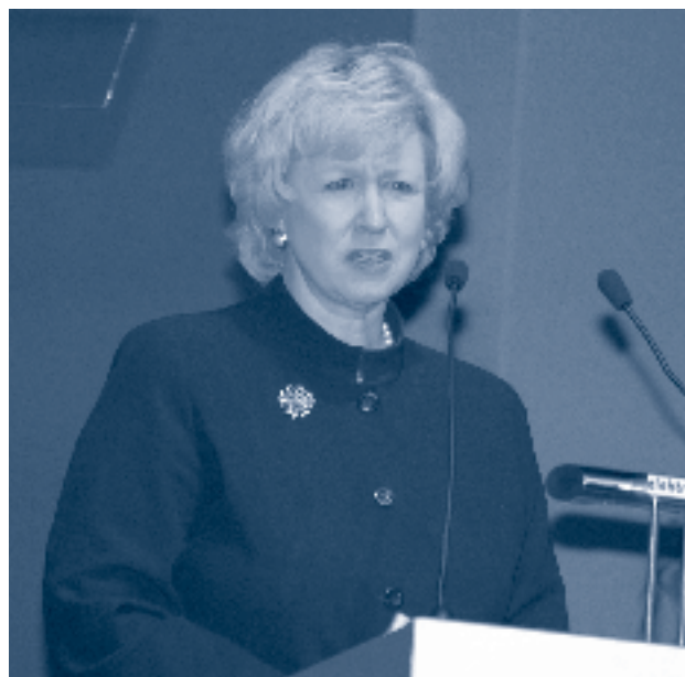
The Rt. Hon. Kim Campbell, Secretary-General of the Club of Madrid

Fellow democrats, these are not merely theoretical constructs. This is about honor, dignity, and human survival. Every day that passes without change means another bleak night for a political prisoner languishing in solitude, another death from hunger, destitution, and disease as a result of neglect and deprivation and another opportunity for the corrupt to abscond millions from the state coffers. For us this is not a luxury of intellectual discourse. . . . It is our fervent hope that democratic forces throughout the world will continue to assert their will and build a strong foundation of universal support to move the agenda forward.