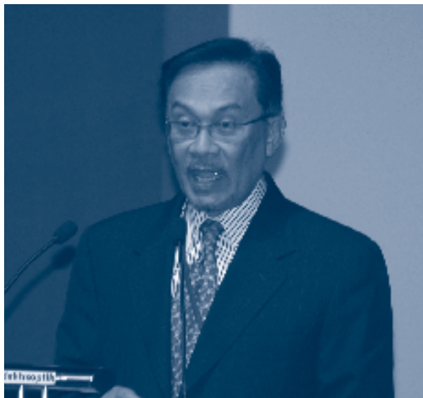
Anwar Ibrahim of Malaysia

Anwar Ibrahim is the former Deputy Prime Minister of Malaysia and one of the world’s leading Muslim democrats. Detained without trial for 18 months in 1974 following student protests, he was elected to the Malaysian parliament in 1982. In 1987 he was elected Vice-President of United Malays National Organization, the ruling coalition’s principal party. In 1993 he was appointed Deputy Prime Minister while continuing to serve as Finance Minister. Sacked from the government in 1998 and imprisoned on trumped-up charges, he was acquitted in September, 2004.