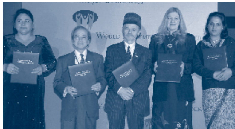
Recipients of the Democracy Courage Tributes