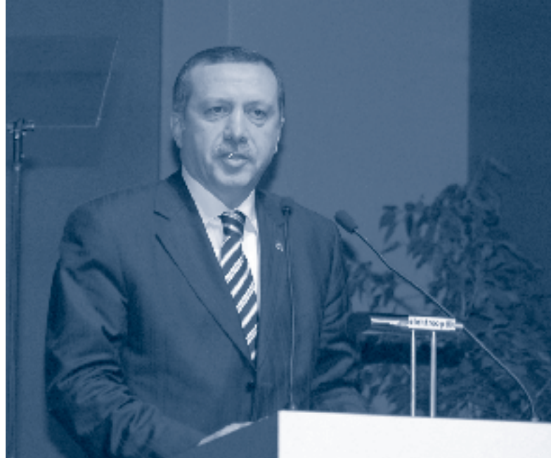
Recep Tayyip Erdoğan, Prime Minister of Turkey

We are currently living the days that were predicted by