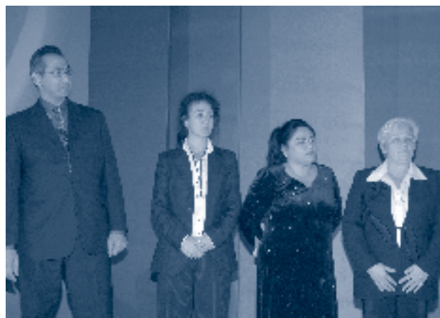
Courage Tribute recipients representing The Human Rights and Democracy Movement in Uzbekistan

During the past year, more than a dozen Uzbek activists, including human rights defenders, journalists, and opposition politicians, have been jailed on spurious charges. We pay tribute to the following groups that have continued their extraordinary advocacy in the face of this campaign of repression: Human Rights Society of Uzbekistan-Ezgulik, Mothers Against the Death Penalty and Torture, Legal Aid Society of Uzbekistan, Human Rights Society of Uzbekistan, Ozod Ovoz, Arena news service, Burning Hearts, Appellation, and members of the political opposition parties Free Peasant's Party, Sunshine Uzbekistan, Erk and Berlik.