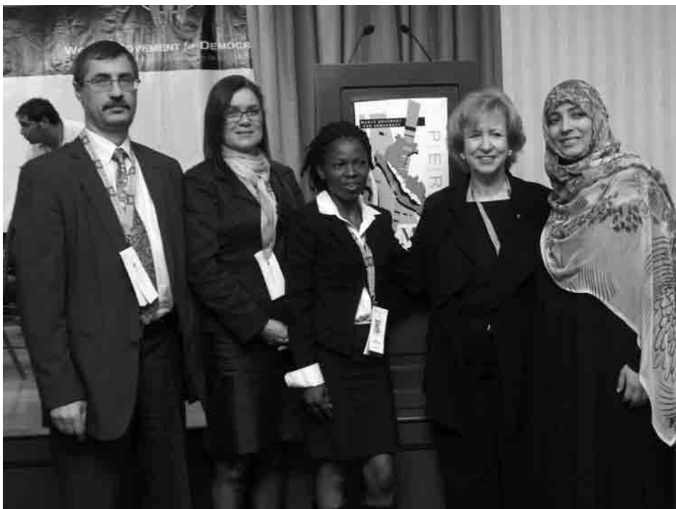
The Rt. Hon. Kim Campbell, chair, World Movement Steering Committee, with opening presenters Yevgeniy Zhovtis (Kazakhstan), Nobel Laureate Tawakkol Karman (Yemen), and Glanis Changachirere (Zimbabwe).

I have a fourth reflection: Following Giddens, it is not enough to have a formal democratic political system. It is necessary to democratize all the spheres of common life, beginning with a democratic culture capable of comprehending problems as diverse as those raised by the rights of women or the rights of indigenous peoples, which are two priorities for the government of President Humala.