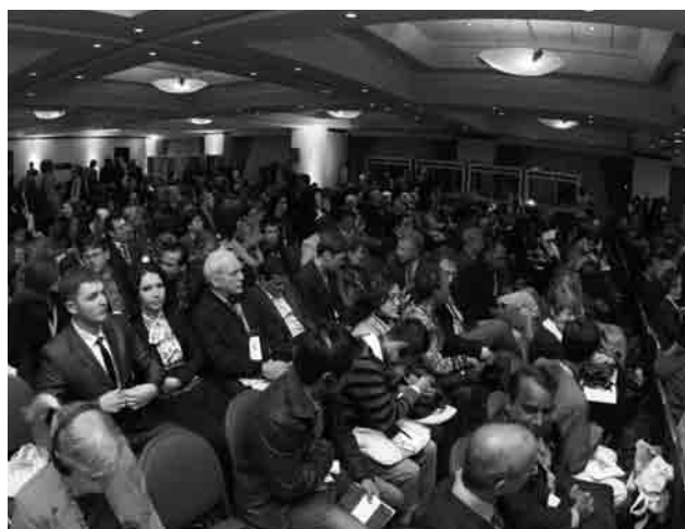
World Movement participants gathered for the opening session of the World Movement's Seventh Assembly in Lima, Peru.

. . . Once more: Bienvenidos. Welcome. Bienvenue. Mar daban. Dobro Pozhalobat. Nimen hao. It is a great honor for me to declare the Lima Assembly of the World Movement for Democracy open. Thank you very much.