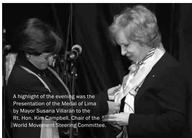
A highlight of the evening was the Presentation of the Medal of Lima by Mayor Susana Villarán to the Rt. Hon. Kim Campbell, Chair of the World Movement Steering Committee.