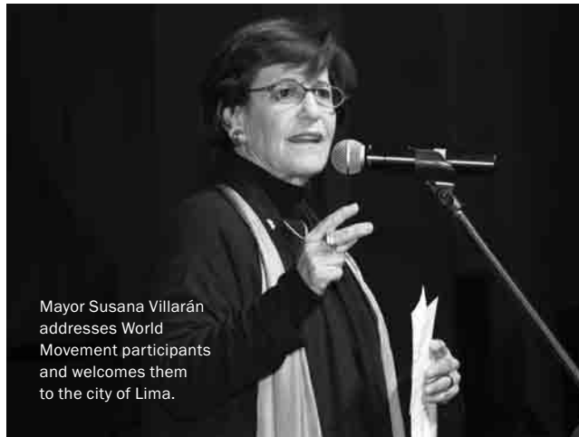
Mayor Susana Villarán addresses World Movement participants and welcomes them to the city of Lima.

The Metropolitan Municipality of Lima and Mayor Susana Villarán de la Puente hosted a cultural evening and reception for assembly participants.