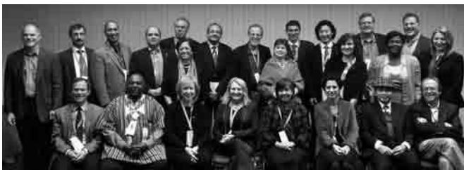
Steering Committee members seen with Secretariat staff at the World Movement's Seventh Assembly in Lima, Peru, in October 2012.